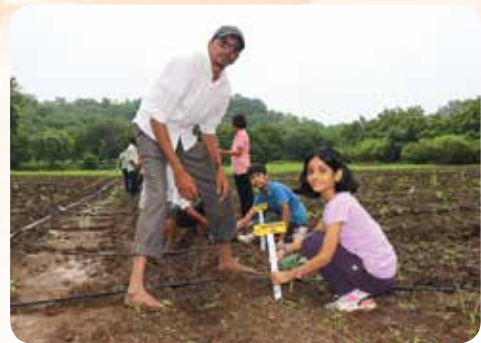
One for the earth