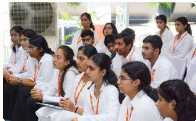
Interaction during AGM