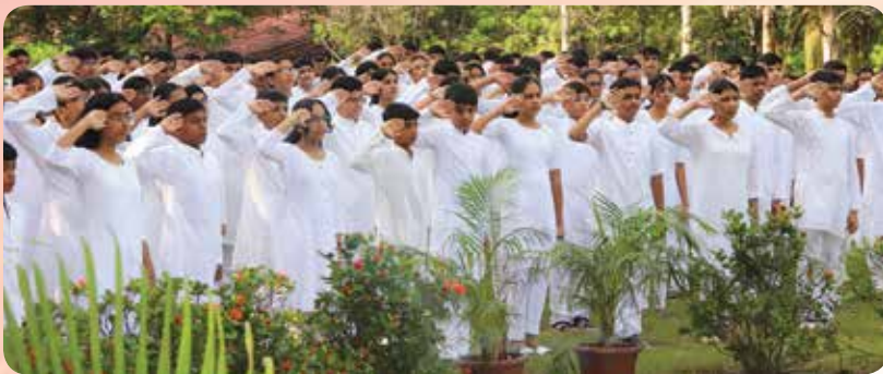
Maa Tujhe Salam