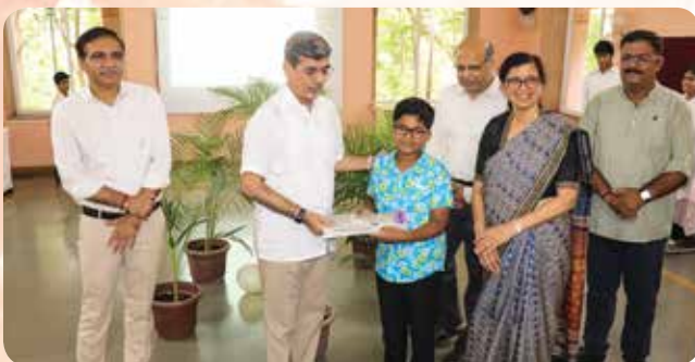
The Xi-mious Sale opens