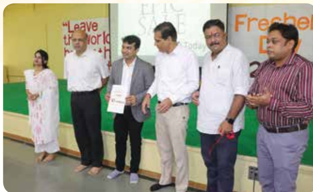
Welcoming the guest on AEP