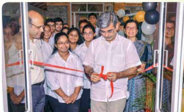
Inauguration of our Grand Epic Sale by Chairman Sir