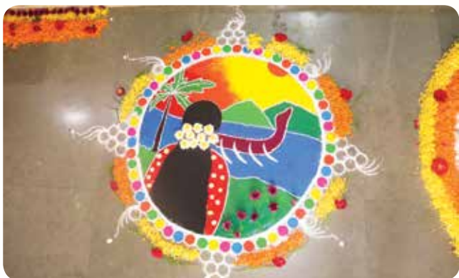
Rangoli on Onam