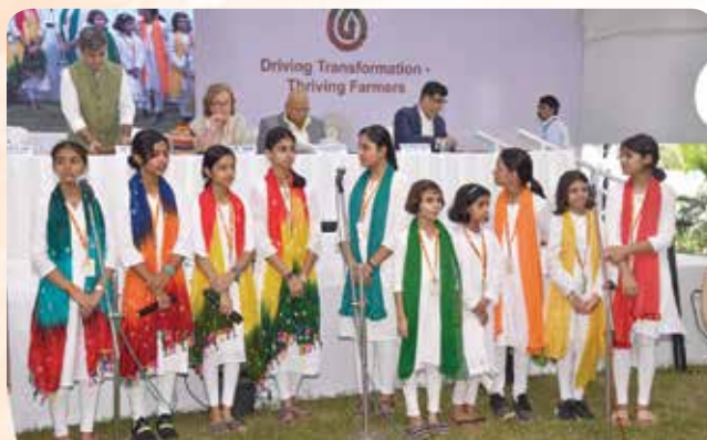
Performance during AGM