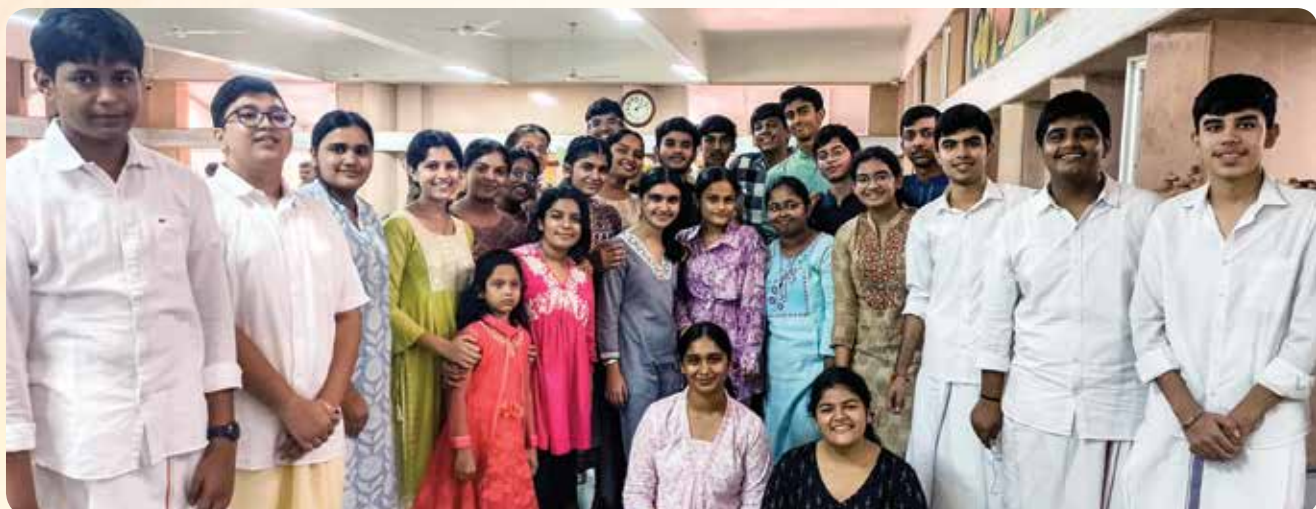
All roads lead to Kerala_Onam