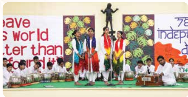
Melody in the air